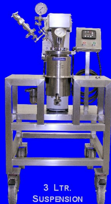
3 LTR. SUSPENSION PROCESS SYSTEM