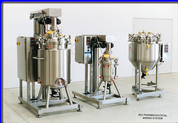
BIO PHARMACEUTICAL MIXING SYSTEM

The Scott Laboratory Mixers are the most versatile small process development mixers available. A wide range of mixing jobs are easily handled in batches from 250 ml. through 50 liters. Achieve accurate scale up from lab evaluation to pilot plant and production applications for both batch and inline operations.