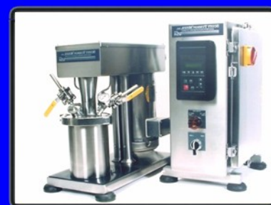
LAB MIXER WITH VACUUM