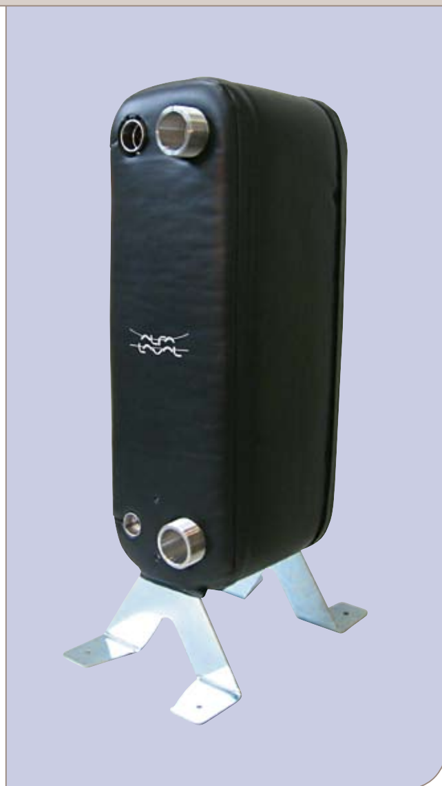
Insulation TYPE P