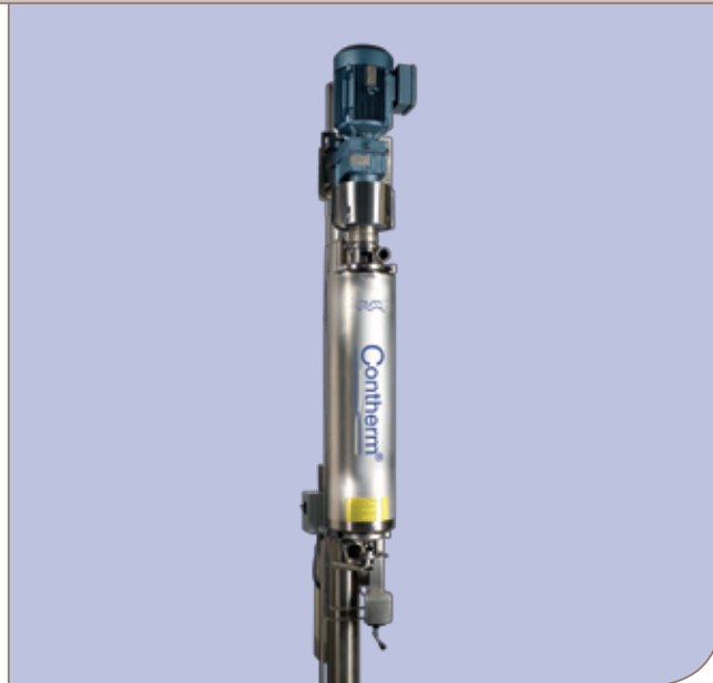
Contherm SSHE model 6x6

Product enters the cylinder through the lower product head and flows upwards through the cylinder. At the same time, the heating/cooling media travels in counter-current flow through the narrow annular channel between the heat transfer wall and the insulated jacket.