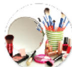
Cosmetics & Toiletries