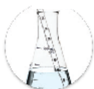
Medical & Ophthalmic